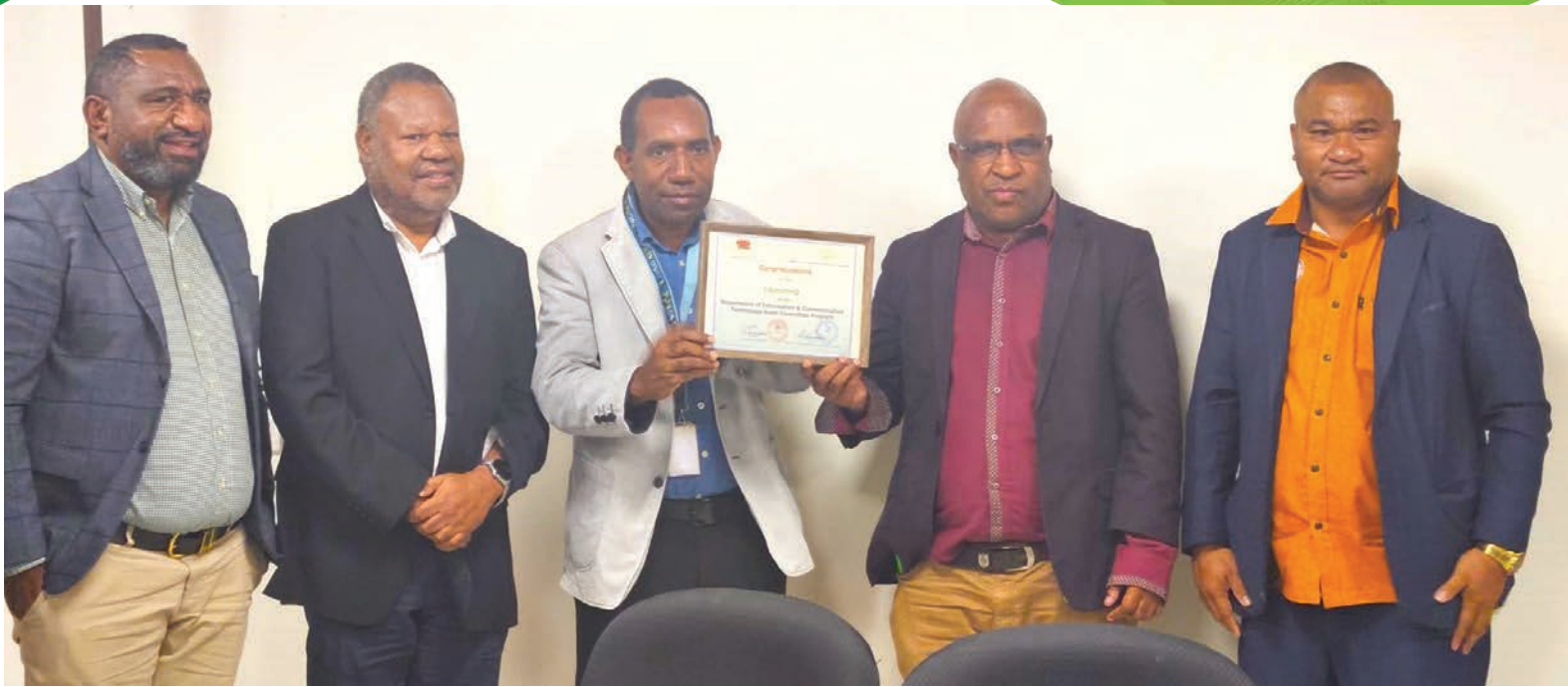
Pictured :The presentation of Public Service Audit Committee Program Certificate to the management & Staff of Department of Information Communication and Technology (DICT)after the launching of Audit Committee