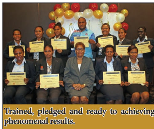
Trained, pledged and ready to achieving phenomenal results.