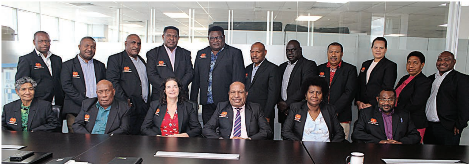
The senior management team flaunting in the new suit courtesy of the Finance Ministry.