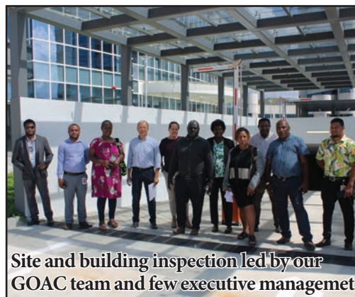
Site and building inspection led by our GOAC team and few executive management